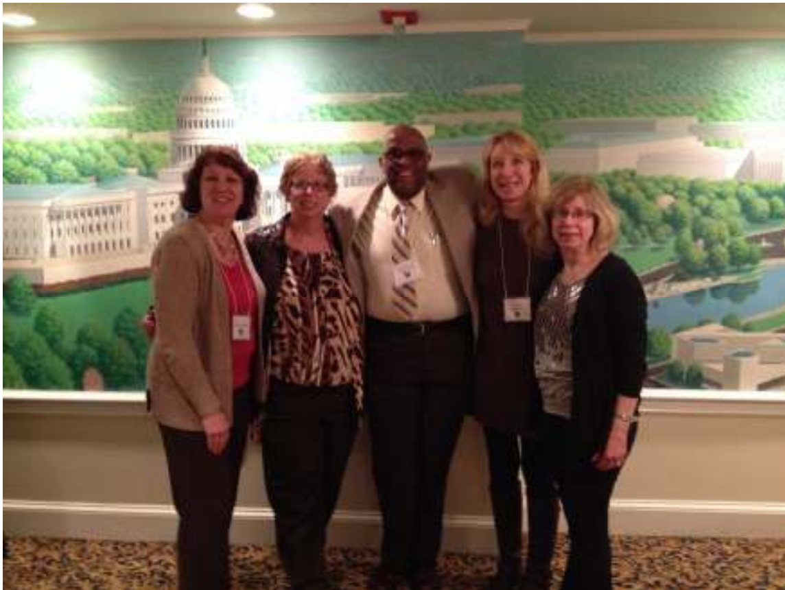
SGNA Legislative Healthcare Committee in Washington DC