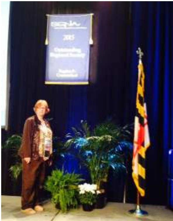
CTSGNA Region 9 received The Outstanding Regional Society Award